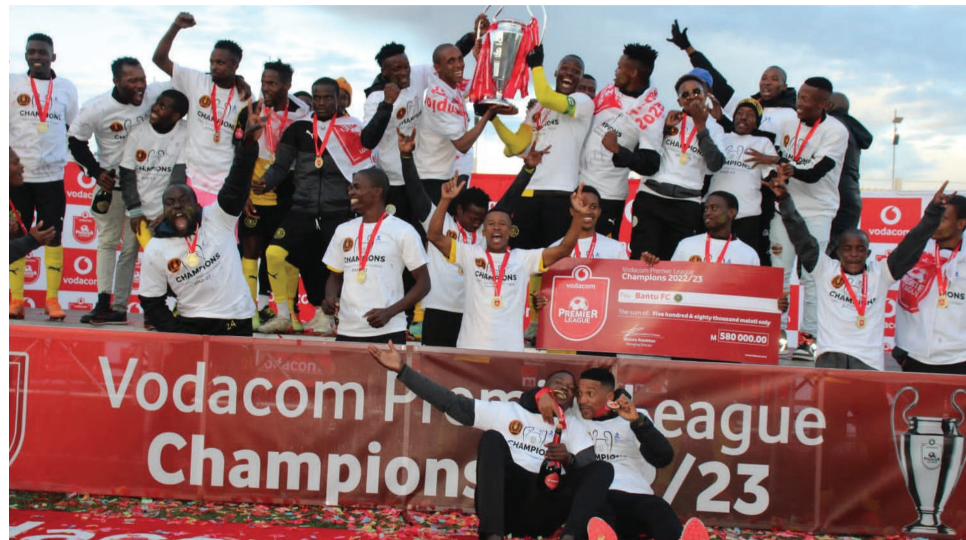
BANTU celebrate victory after winning the 2022-23 Vodacom Premier League.