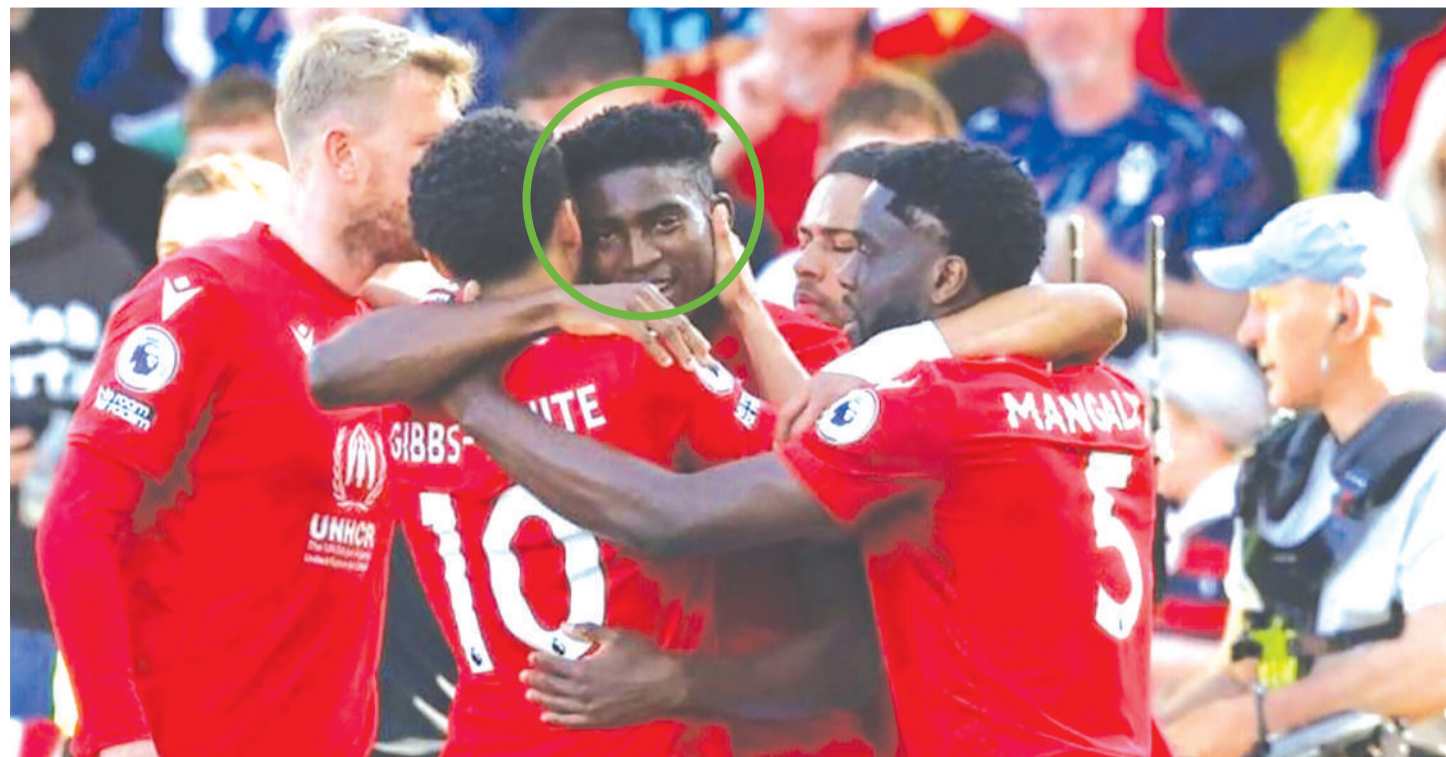
AWONIYI (circled) celebrates with teammates as he scores against Arsenal to secure Premier League status for Nottingham Forest.

he may be, though, his finish here was fortunate, Gabriel's sliding challenge hooking the ball into his lower shin, from where it scooted over the sliding Aaron Ramsdale — a goal made by the precision of the pass.