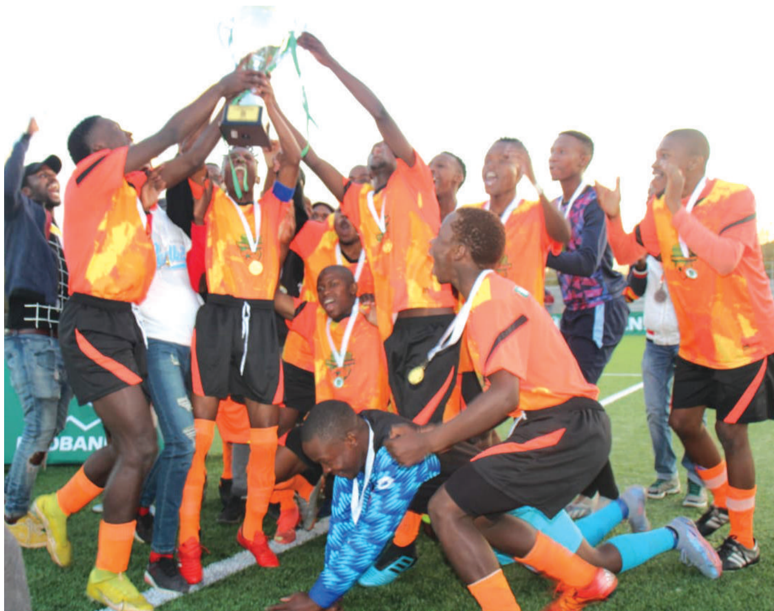
ACE Maseru celebrate after winning Nedbank Top 8 at Bambatha Tšita Sport Arena last Sunday.

"Apart from that we need money to help the team prepare for its new life in the premier league. Therefore, it is important to win all the trophies because they come with money." The winner of the champion of champions duel will get M20 000 while the runners-up will take home M15 000.