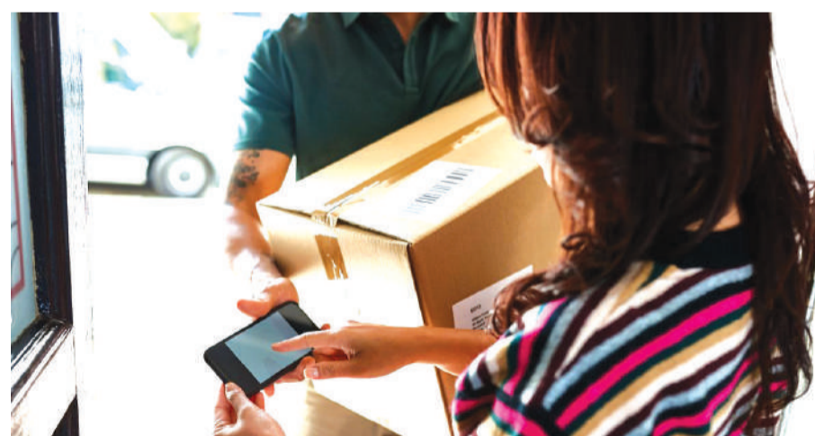
THE neighbour constantly has parcels delivered to their address.

He later clarified his situation in an edit which read: "I should add that this is an HMO, and the multiple tenants rarely stay more than a few months. Hence why I don't get to know them and why it will be difficult to track down which one put the note up.