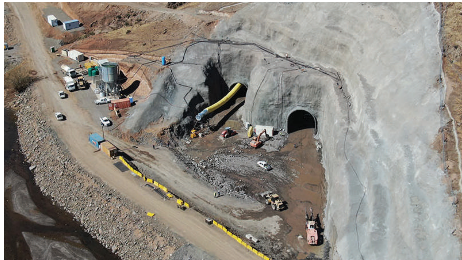
POLIHALI Dam under construction.