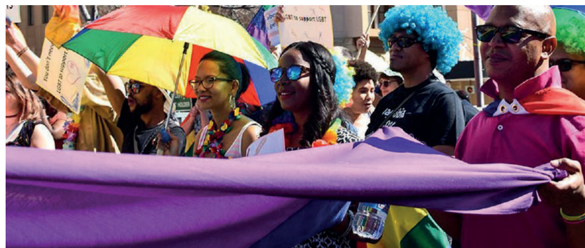
DOZENS of people cheer and dance as they take part in the Namibian Lesbians, Gay, Bisexual and Transexual (LGBT) community pride Parade in the streets.

E ARLIER this week the Namibian Supreme Court ruled that the government's refusal to recognise the validity of same-sex marriages concluded outside Namibia for the purpose of immigration law infringes the interrelated rights to dignity and equality guaranteed in the Namibian Constitution. While the judgement will, for now, only benefit a few same-sex couples who marry elsewhere, it contains powerful language that could be used to challenge the validity of other legislation that currently discriminates against LGBTIQ+ individuals in Namibia.