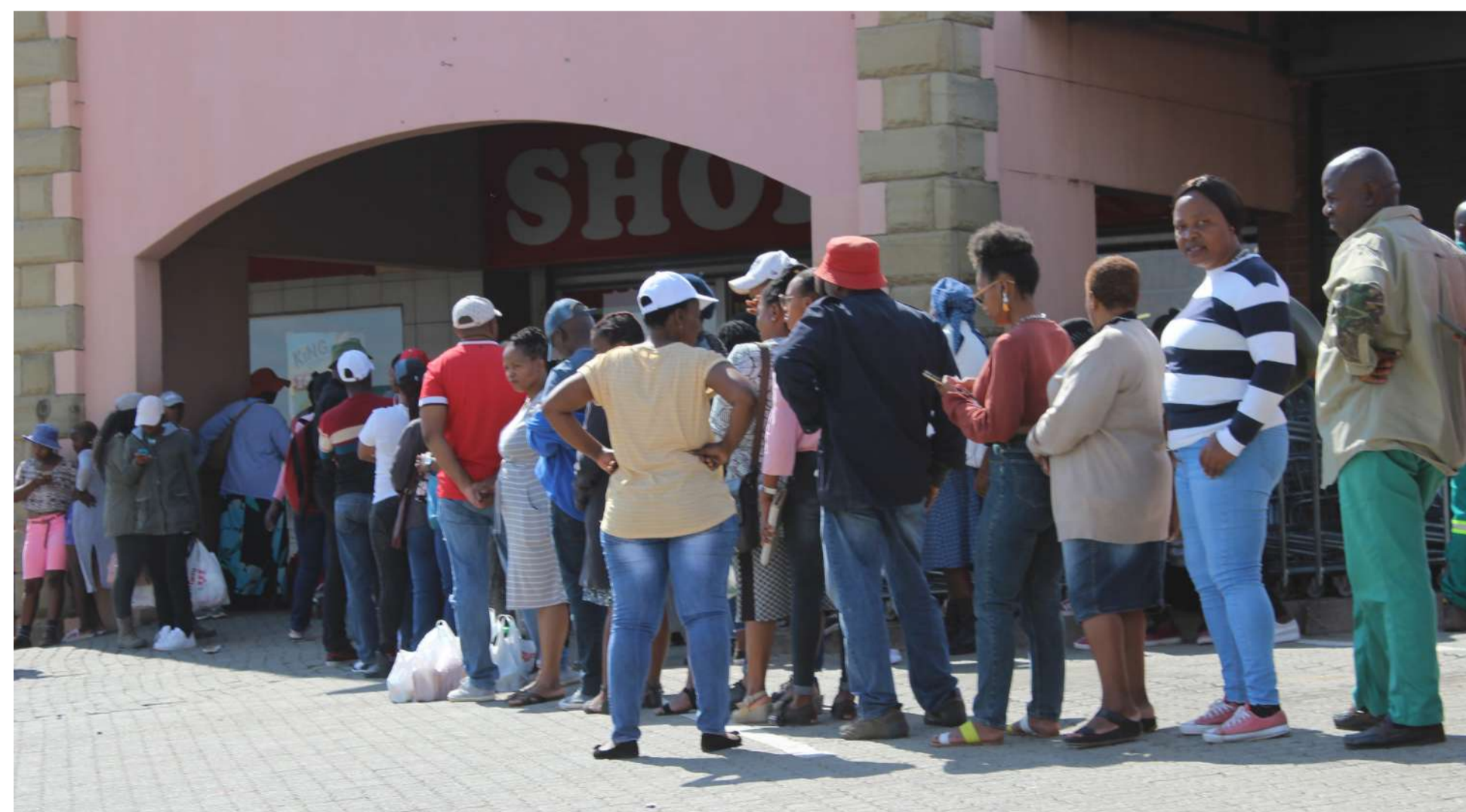
SHOPPERS who queued to buy groceries in Maseru this past week disregarded World Health Organisation (WHO) social distancing protocols aimed at preventing the spread of COVID-19.