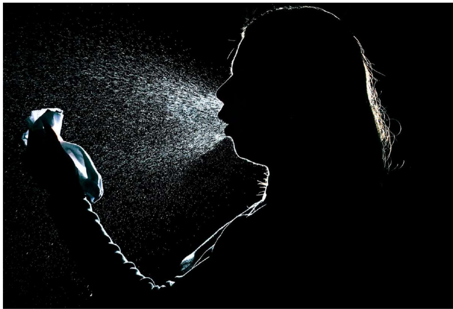
LARGE virus-laden droplets from infected people's coughs and sneezes fall to the ground within 1-2 metres.

But researchers say the importance of potential airborne transmission, and the possible boosting role of pollution particles, mean it