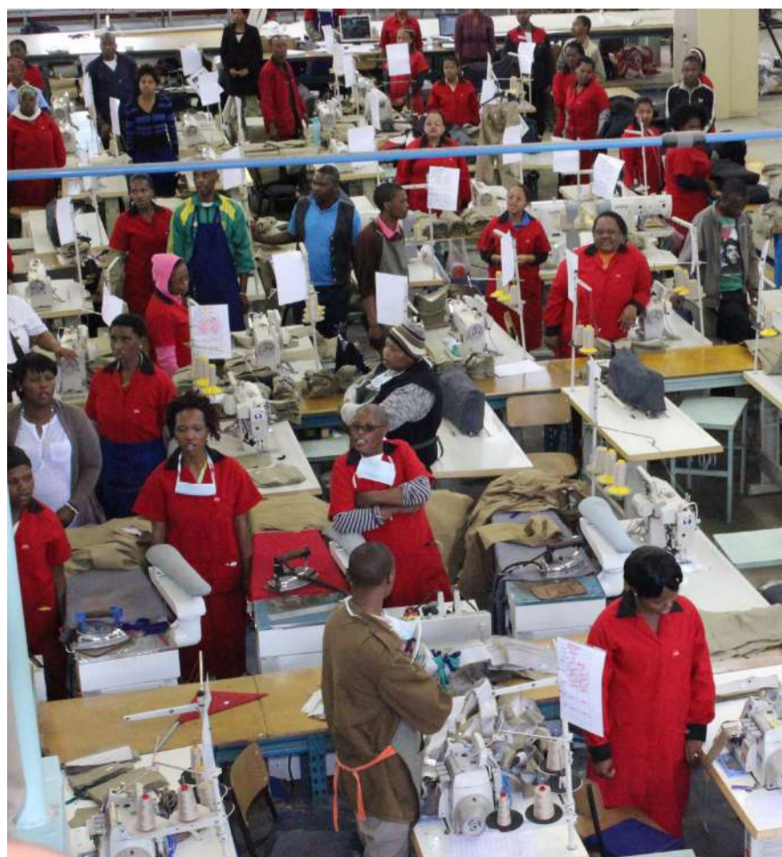
WORKERS in one of Jonsson Manufacturing's factories in Maputsoe.

This is meant to ensure that the staff has access to their standard medical care for non-coronavirus related ailments during the lockdown and remain fit until work resumes.