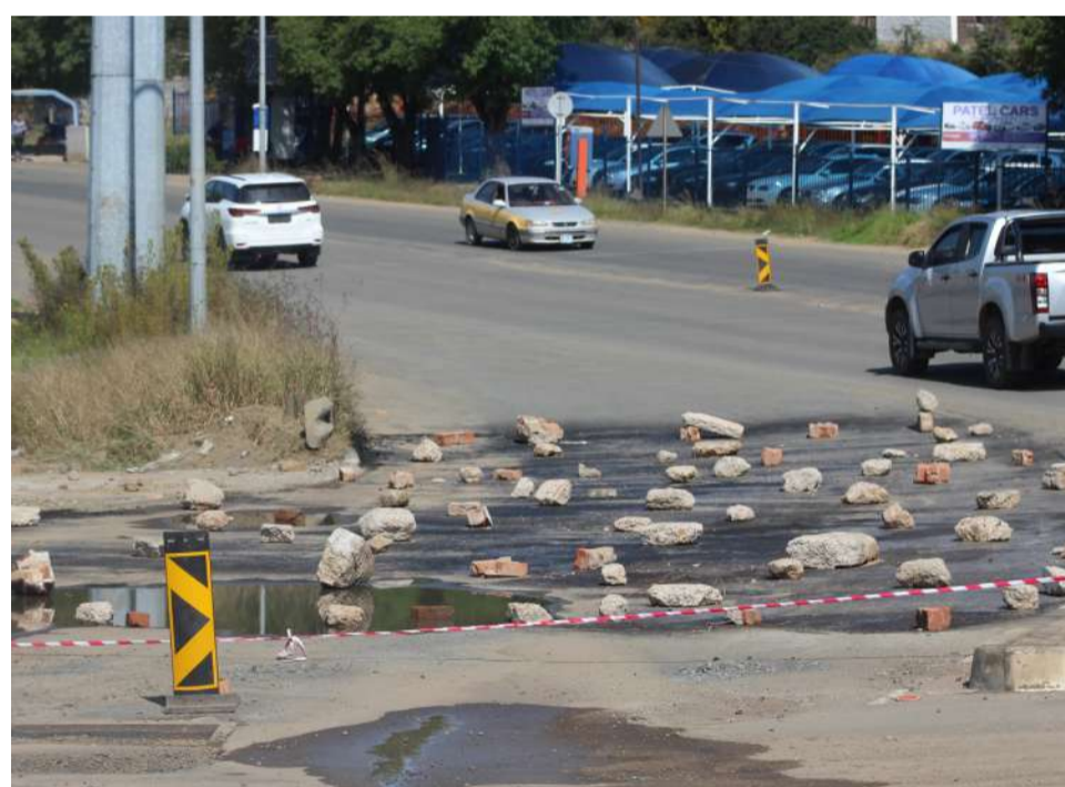
PART of the road that is being repaired at the Pioneer circle in Maseru.