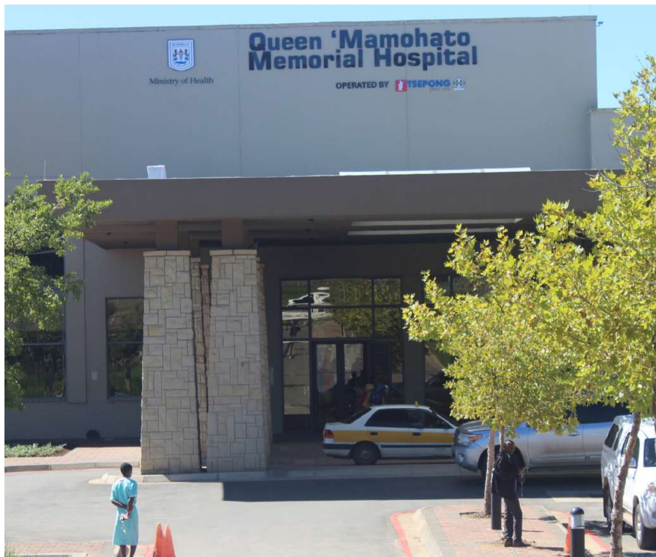
QUEEN Mamohato Memorial Hospital.

She said contrary to reports that they had admitted the suspect, the suspect left the hospital on Friday and was either in self-quarantine at home or at one of the quarantine facilities set up by the Health ministry.