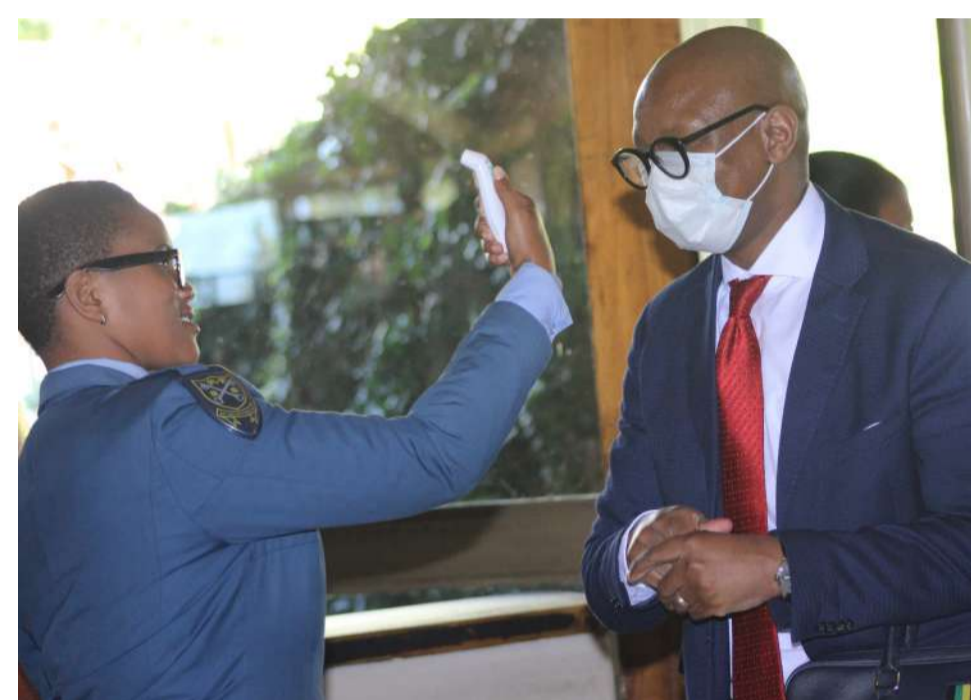
A SECURITY officer takes a temperature reading of one of the officials at Avani Lesotho during COVID-19 lockdown on Monday.